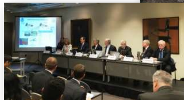
Screenshot from Stuffinspace.net; cover of Apogeo Spatial spring issue; panelists at “Challenges in Sharing Weather Satellite Spectrum with Terrestrial Networks” event held in Wash. D.C.